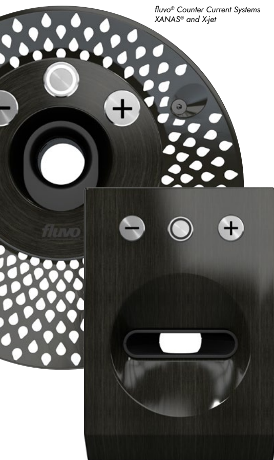
fluvo ® Counter Current Systems XANAS ® and X-jet