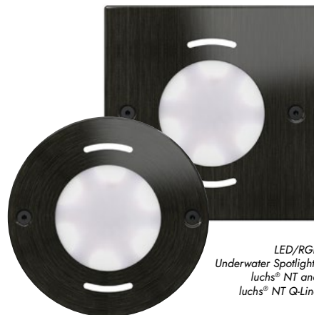
LED/RGB Underwater Spotlights luchs ® NT and luchs ® NT Q-Line