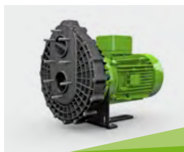
Swimming pool pumps