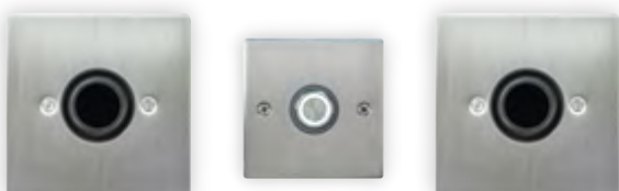
Fig.: karibic Q-Line (stainless steel matt or glossy)