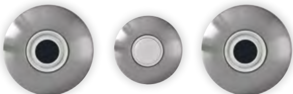
Fig.: karibic pro