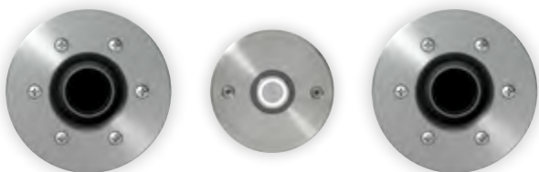
Fig.: karibic with short nozzle